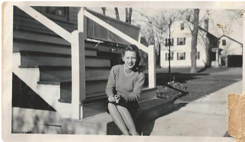
Beginning her career