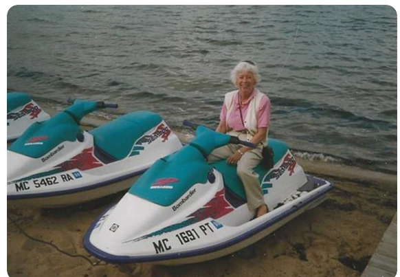
Always having fun!