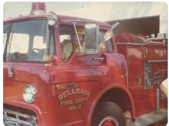
Happy to help wherever needed!